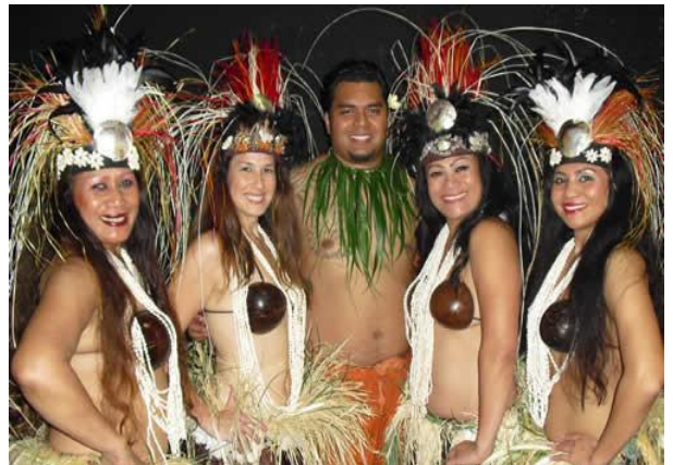
Mahalo nui loa for your support!

Polynesian Culture Association, Inc. Mail this form with your contribution to: Polynesian Culture Association Inc. 44914491 NW 19th St. Oakland Park, FL 33309